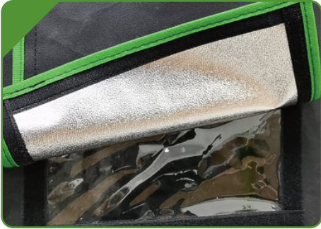
• Inspection window.