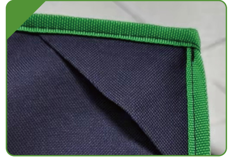
• Corner reinforcements.