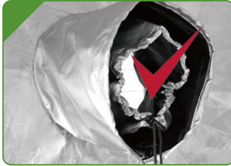
• Dual-layer ventilation opening.