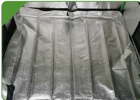
• Good Skilled Sewing.